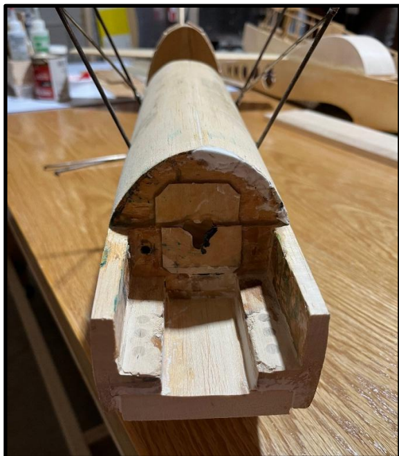
The AM's new nose block

Next, the fun stuff: I've recently been called a "flying fool" and a "building machine". I actually appreciated this bout of name-calling. The first was related to a rare Saturday that I was able to hang out at the field for most of the day. I managed to get in several flights that day and had a great time conversing with the club members in attendance. Yes, I was able to get my Trainer in the air and she flies splendidly. The amount of vertical she has on 6S batteries is impressive for an eight-pound high-wing plane. I also got in a few flights of my Northstar, which is climbing up on my favorites list.