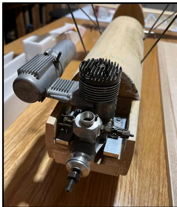
The engine mounts on the AM