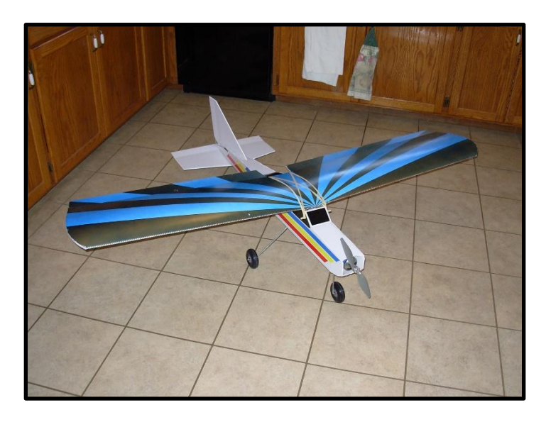
Ryan's Trainer ready for maiden flight 13 years ago

Now that I've gotten that taken care of, I can move on to some other fun stuff: Adventures in Aeromodelling, my ever-faithful Trainer. I keep a photo album on my phone that is for any RC airplane related pictures. When looking back, the first digital photo I have of my airplanes is of my Trainer when I had just completed the final touches.