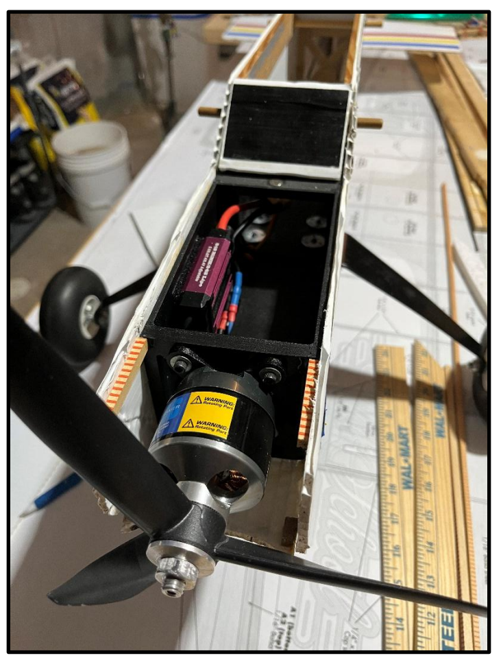
The finished assembly glued in

The Coroplast and yard stick airplane has been through a lot over the 13 years that I've flown her. Since she was my first plane of my own that I soloed on, she has endured many crashes and injuries as I worked to gain the experience I needed. It seems that every repair I've made has only made the characteristically heavy plastic plane heavier. After my latest addition, the 3D printed structure that connects everything from firewall to main landing gear, I was nervous that she would be too heavy to fly.