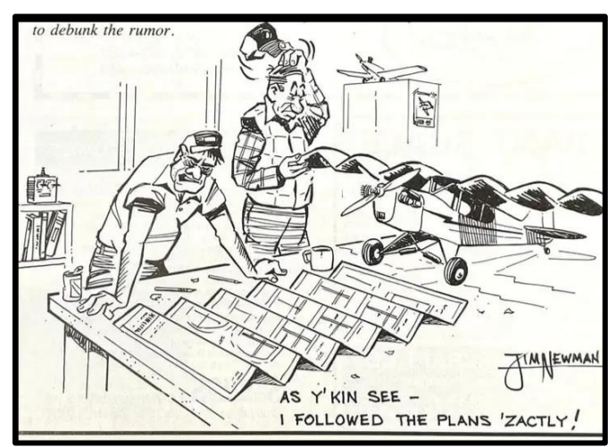
At least he got the fuselage right...?