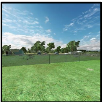
Doug's version of the ACRC field