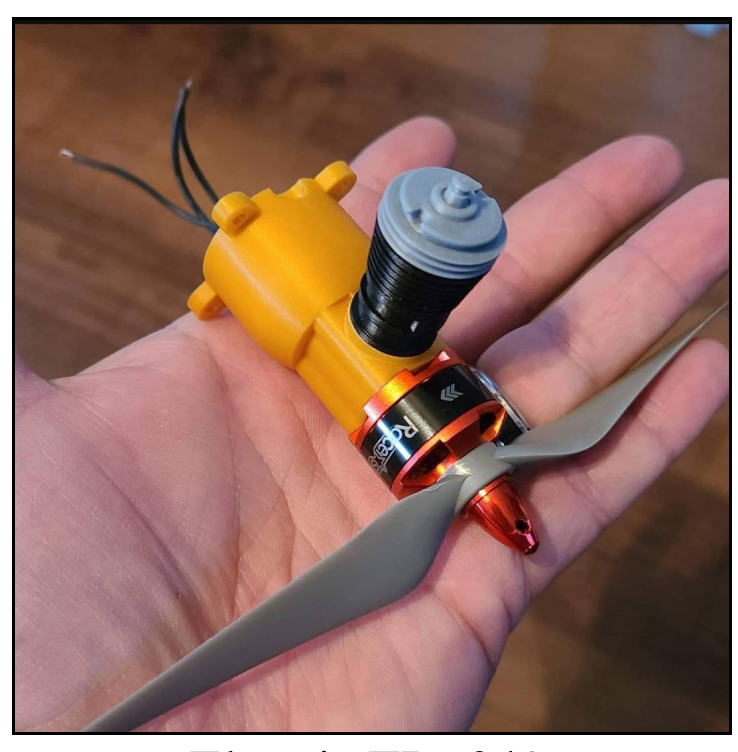
Electric TD .049