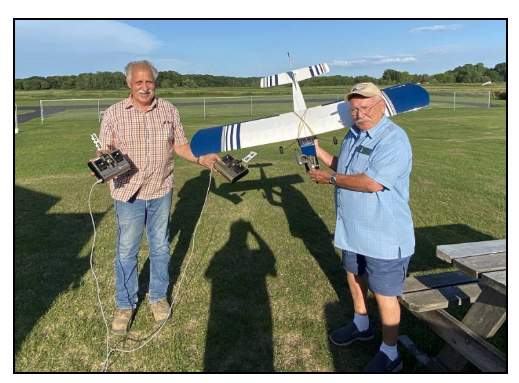
One of Jim's planes donated to the ACRC training program.