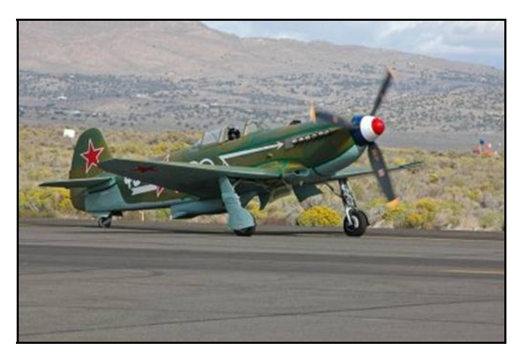
NAME THE PLANE

When installing landing gear onto the fuselage with plastic or nylon bolts, place a thin 1/16-thick sheet of light plywood or balsa between the aluminum gear and the bottom of the fuse. This way, if by chance you land hard and sheer the plastic screws, you have a better chance of getting a grip on a section of the broken plastic for easier removal. (Tech editor's note: Possibly. But better would be to heat the tip of a screw driver in a propane torch and push the hot screwdriver into the broken bolt, it will make a very nice screwdriver slot.)