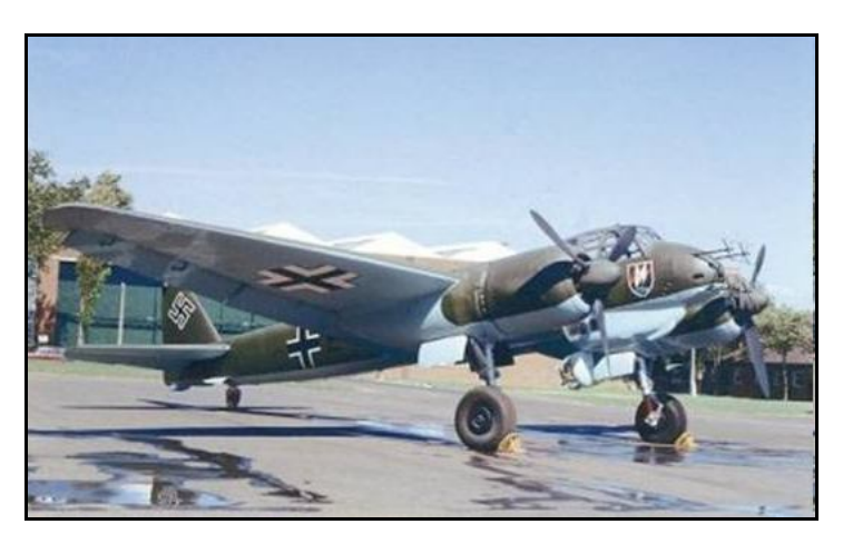
NAME THE PLANE