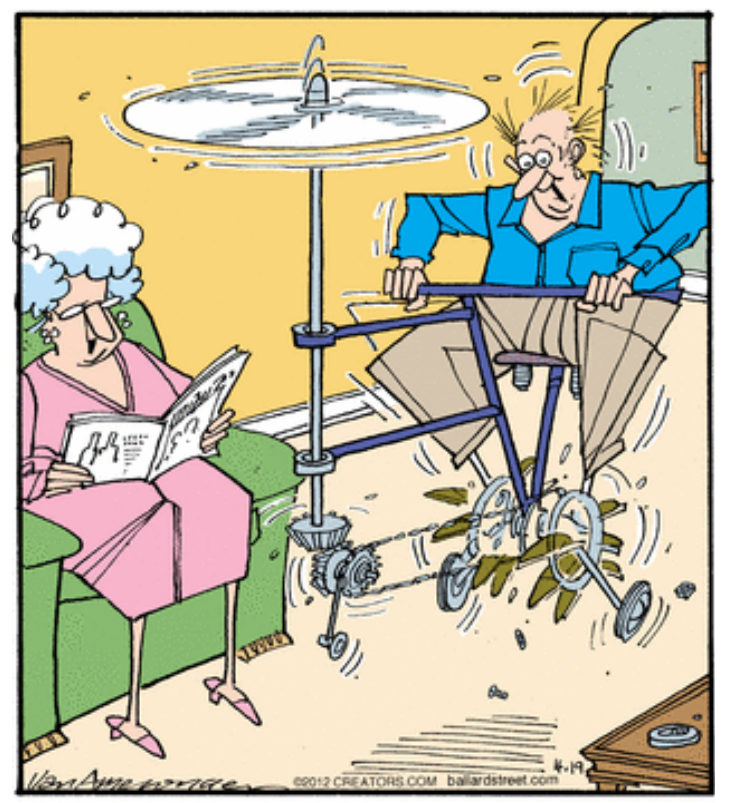
Paul, please, that's an outdoor activity!