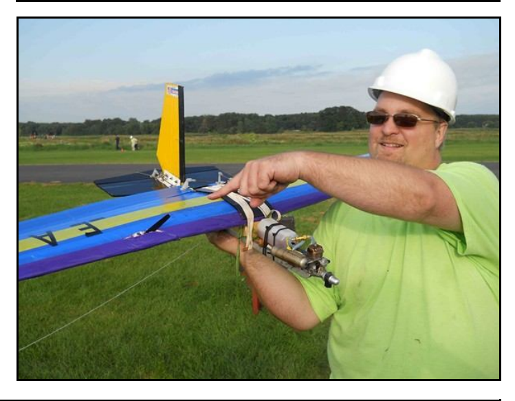
More pictures are available on the ACRC Forum - <a href="http://anoka-rc.com/forums">http://anoka-rc.com/forums</a>