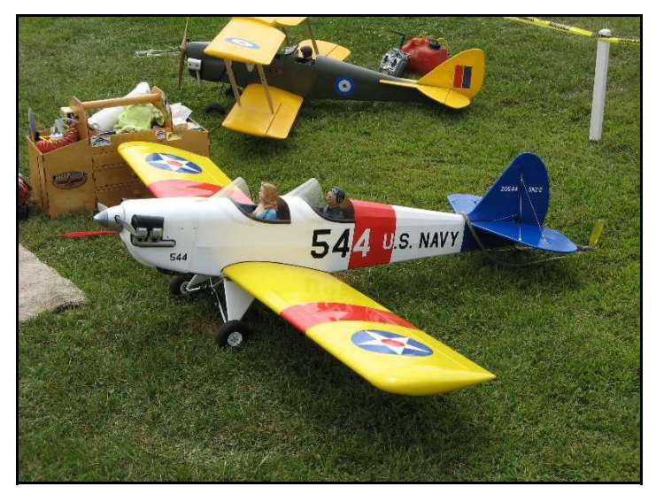
More pictures are available on the ACRC Forum - <a href="http://anoka-rc.com/forums">http://anoka-rc.com/forums</a>