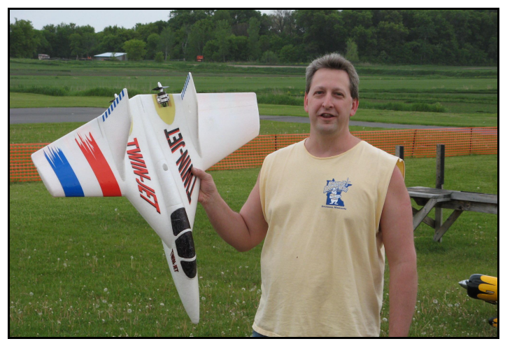
control horns on the elevons. He estimates top speed at about 115 MPH.