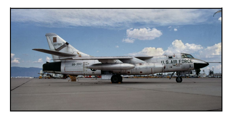
Douglas B-66D Destroyer

Every field has different rules for the use of a pilot spotter during flight operations. Most fields do not require a spotter when no organized event is scheduled, or the number of pilots flying is low. Other fields require a spotter on all flight activities. Most fields require the use of a pilot spotter during all scheduled events. Do check with your club or field rules about the use of a spotter. The ultimate purpose of a pilot spotter is to increase safety for all. So be a good spotter and help keep our field, and our pilots, safe.